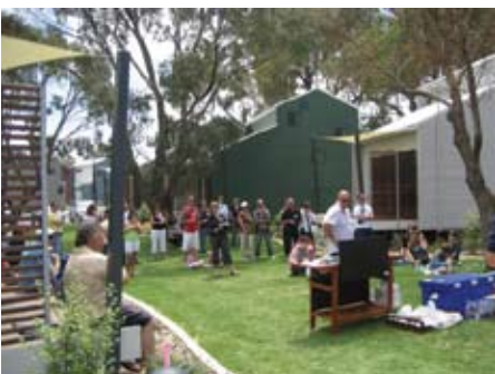
Owners and locals enjoyed the open day