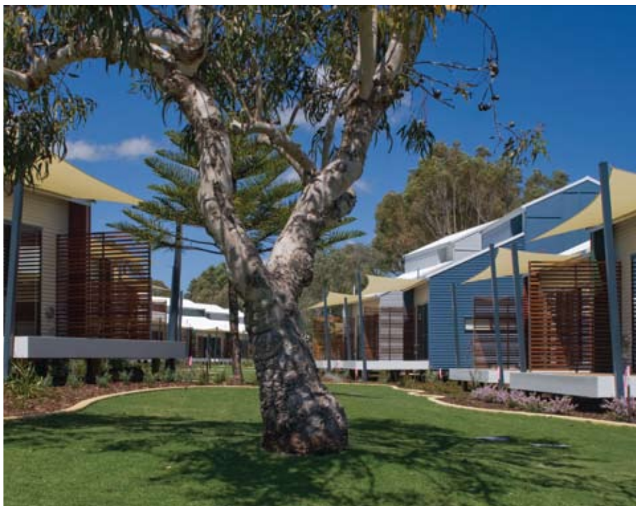
The beach-style units display outstanding quality says Jeff Jamieson