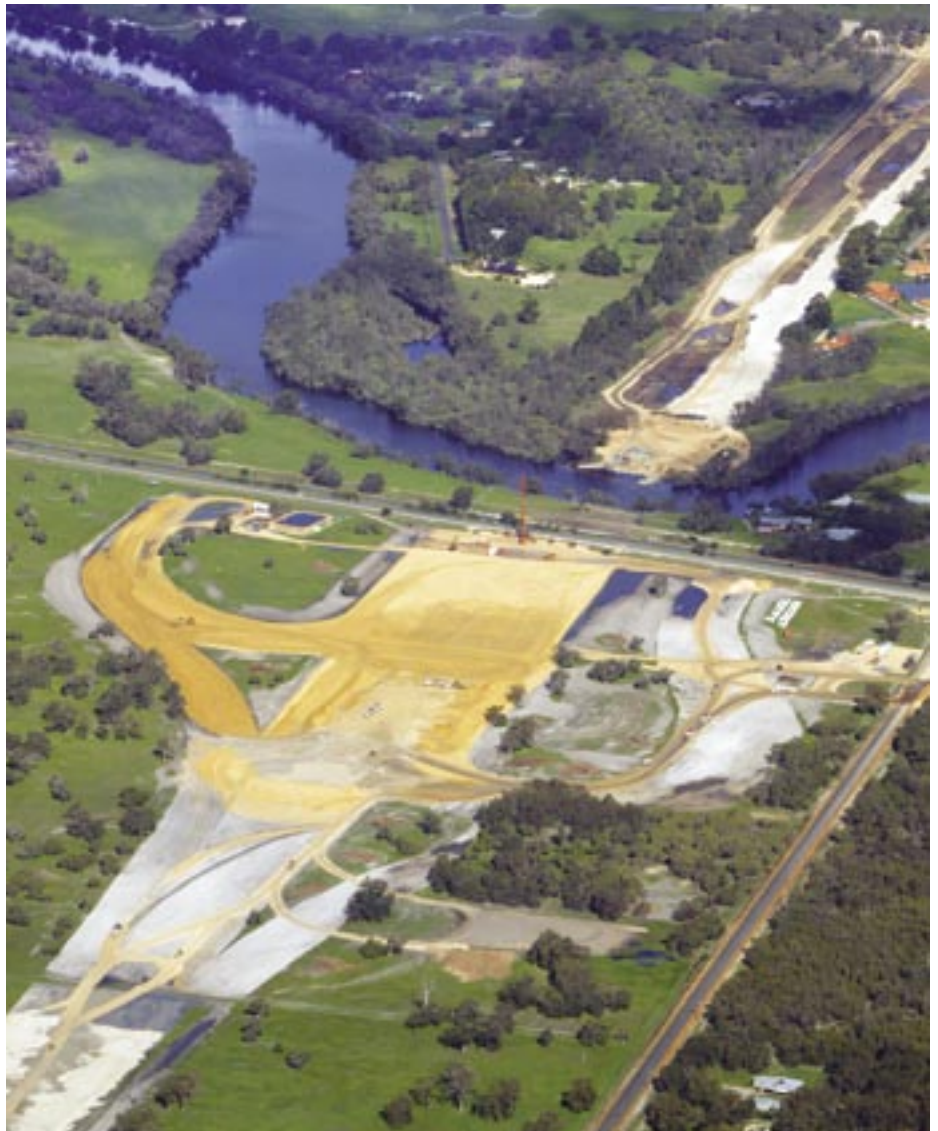
PICTURED ABOVE: Pinjarra Road Interchange and Murray River Crossing

If you would like to follow the progress of the new Perth Bunbury Highway then just log onto www.mainroads.wa.gov.au and click on the following links: Projects - Rural projects - New Perth Bunbury Highway.