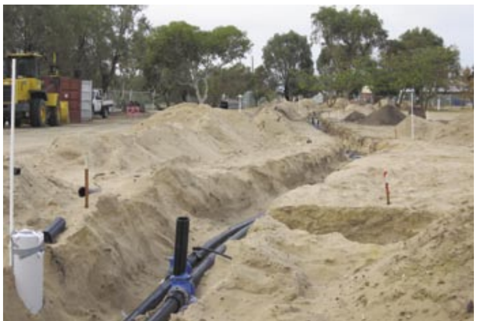
PICTURED TOP: Part of the BioMAX effluent disposal system before installation. PICTURED ABOVE: In-ground services.